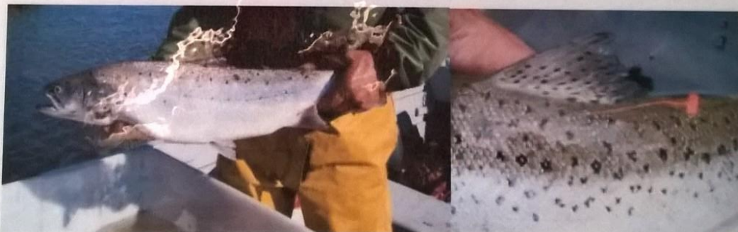
Figure 19: Sea Trout caught and released from the Poole Harbour net. Note the Floy tag by the dorsal fin on the inset photo.